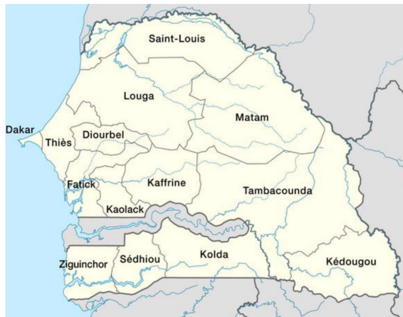
Figure 1. Fourteen regions of Senegal

The country is divided to fourteen regions as follows: Dakar, Diourbel, Fatick, Kaffrine, Koalack, Kédougou, Kolda, Louga, Matam, Saint-Louis, Sédhiou, Tambacounda, Thiès, Ziguinchor (Figure 1). The population is mostly concentrated in the west with a major urban area in Dakar, the capital (3.3 million residents, 2022) and 70% in rural areas. 46.7% of the population lives under the poverty line with an unemployment rate of 48% (2007 est.). The majority of the labor force is occupied in the agriculture sector (77.5%) followed by industry (22.5%) and services (22.5%). 1, 2